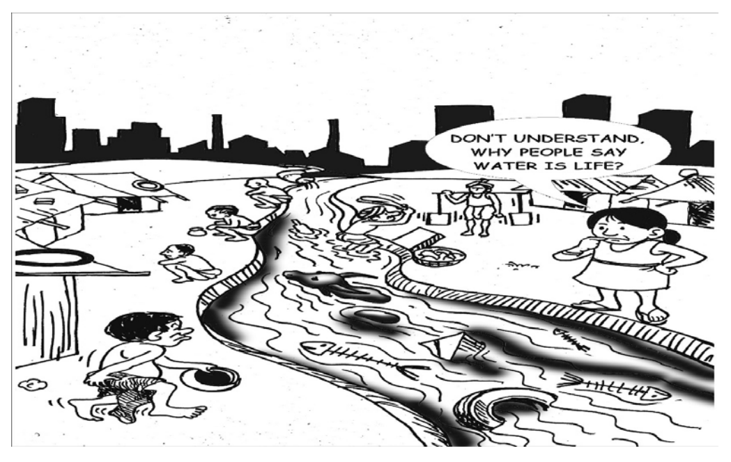
Q4. Develop a short story with the help of the given visual / starting line .Give a suitable title to your story . (150-200 words) 10 marks

India is a highly populated country . People lack in maintaining proper sanitation and hygiene as a result they suffer from various diseases . India has a serious sanitation challenge; around 60 per cent of the world's open defecation takes place in India. Poor sanitation causes health hazards including diarrheoa, particularly in children under 5 years of age, malnutrition and deficiencies in physical development and cognitive ability. You are Nitish /Nikita, head boy/girl of Anand Public School, Jaipur. Write a letter to the editor of a national daily, highlighting the problem and suggesting practical ways to ensure public sanitation and the right to dignity and privacy . (100-120 words, 8 marks )